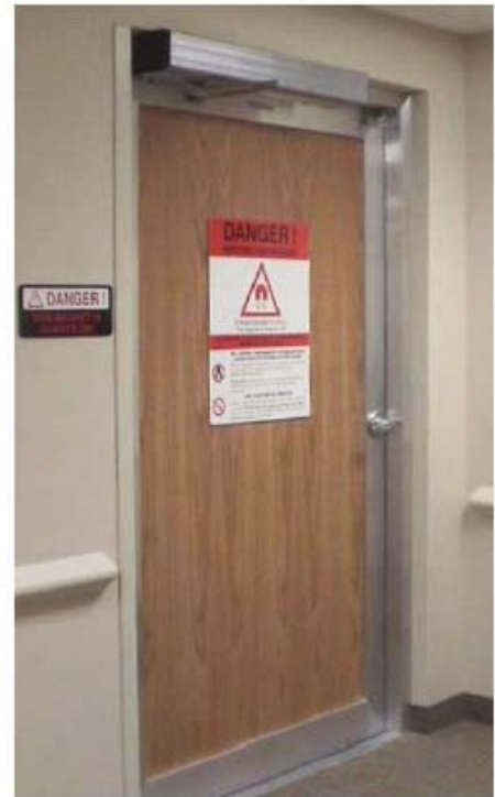
Door Actuator Electric Key Switch